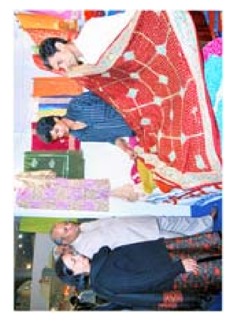
अंतराष्ट्रीय ट्रेड फेयर नयी दिल्ली में नायला कलस्टर विकास समूहों द्वारा निर्मित उत्पादों को देखते हुए उद्योग सचिव, मारत सरकार