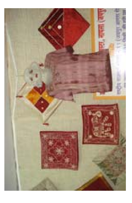
नायला कलस्टर विकास समूहों द्वारा टेक्नीकल अप–ग्रेडेशन प्रशिक्षण लेने के पश्चात निर्मित उत्पाद