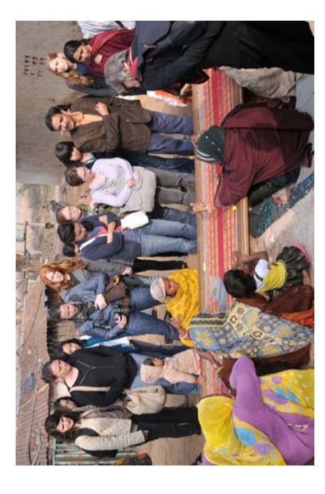
सेंट डियागो यूनिवर्सिटी.कैलिफोर्निया के छात्रों द्वारा महिला सशक्तिकरण हेतु किए जा रहे क्लस्टर कार्यों का अवलोकन करते हुए।